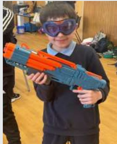
Nerf gun club - what a fabulous club

Year 6s SATs booster clubs have been run this term by the year 6 staff and hopefully your child is benefiting from this extra support. These will continue after Easter.