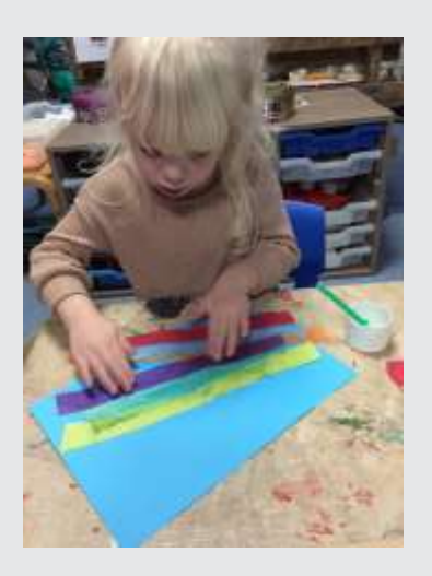
Stars and Comets

It has been a very busy few weeks! In Drawing Club we have focused on the stories 'The Enormous Turnip' and 'The Tiger Who Came To Tea'. When exploring these stories we had tea parties and made vegetable soup. We have also explored the animation 'Pink Panther' which we found very funny. We are starting to write words and numbers in Drawing Club to go with our amazing pictures.